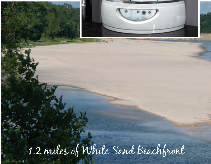
1.2 miles of White Sand Beachfront