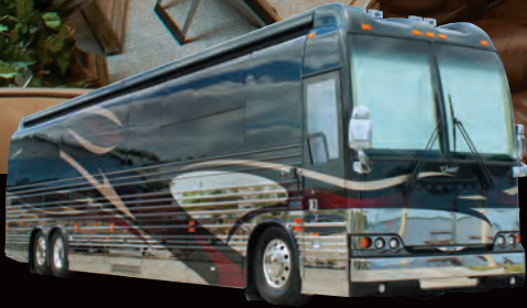
2007 Featherlite XLII-S2 #8930