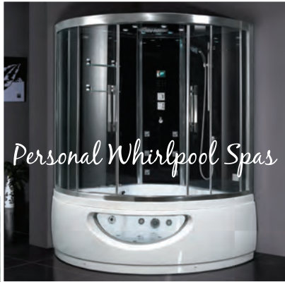
Personal Whirlpool Spas

Outside the individual sites, the resort boasts multiple pools, miles of biking and hiking trails, and a private beach on the Trinity River. Owners and members have full access to The Preserve's five fishing lakes, natural bayous and equestrian trails. Not to mention a large outdoor pavilion with BBQ stations, picnic areas and fire pits.