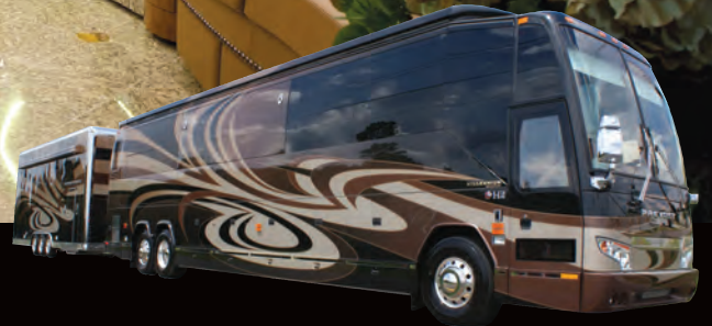
2012 Millennium H3-S3 #516