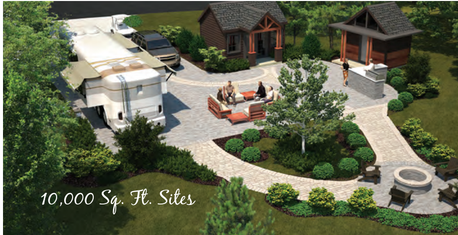
10,000 Sq. Ft. Sites

to a public wash room or meeting area," Levitz said, "you want to stretch out and relax in the privacy of your own space. At The Preserve, you can unwind in your personal sauna and whirl pool tub, read a book in your casita or cook under the stars." The Preserve's lots feature premier landscaping and customizable options that include resort casitas, outdoor kitchens, stone fire pits and private spas.