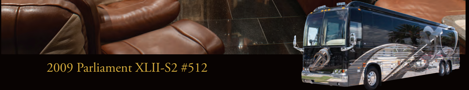
2009 Parliament XLII-S2 #512