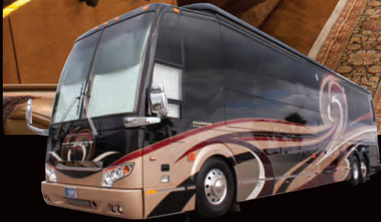
2013 Millennium H3-S4 #513